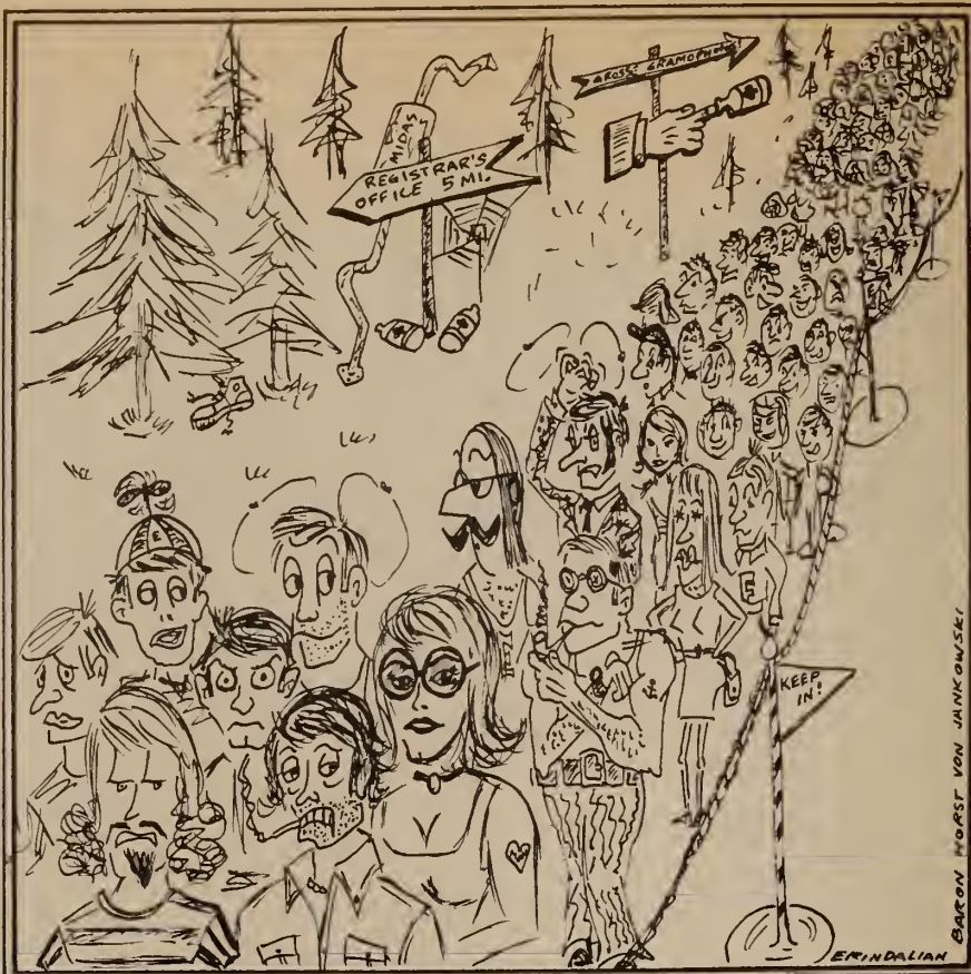
"AND DO YOU HAVE ANY CONFLICTS . . . . ?"